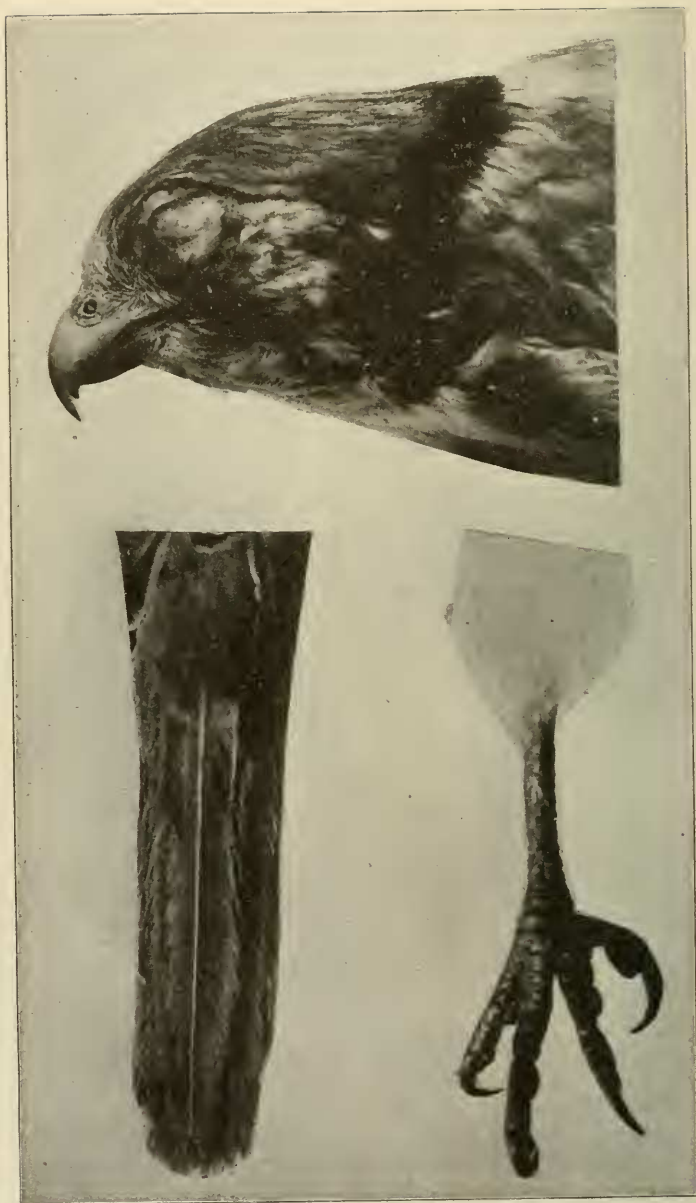
Falco dominicensis , Cuban Hawk.